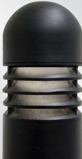
*OWK-2 w/ COG