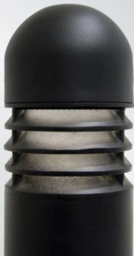
*OWK-2 w/ COG